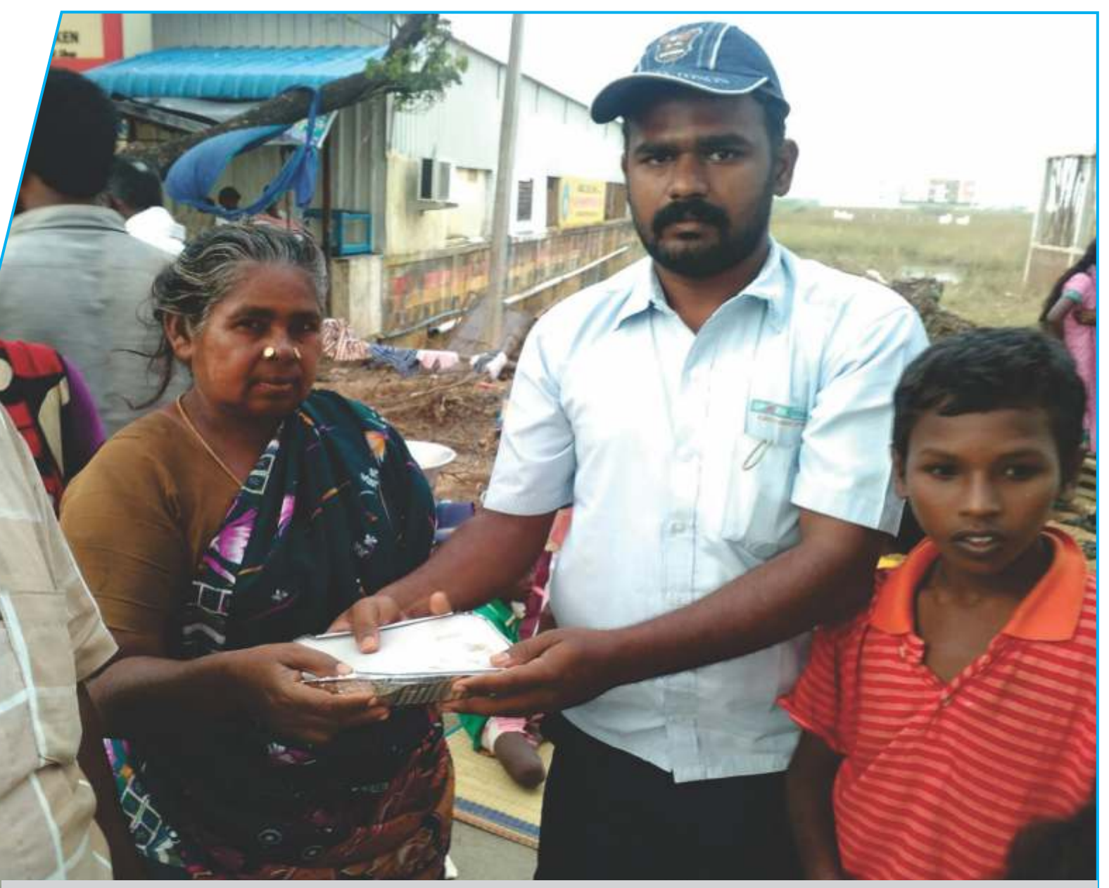
CSR Team executing Primary Relief Work