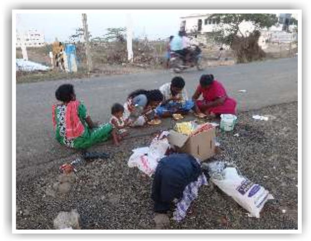
Flood affected people having food distributed by CSR team.