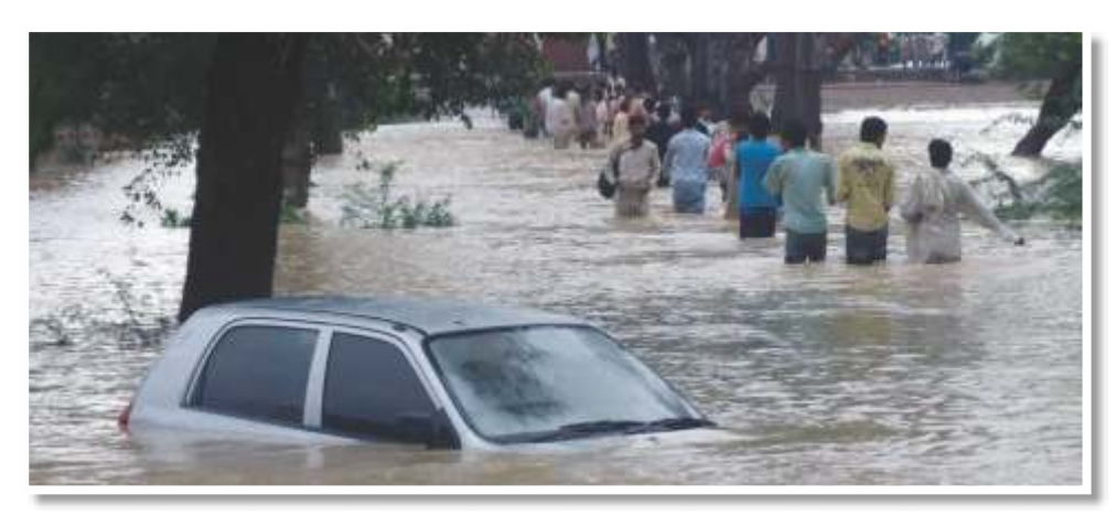
Flood affected roads of Chennai

Our team extended support in the most affected villages adjacent to our Pillaipakkam and Kakkallur Plants by providing relief and survival kits, consisting minimum amenities to the flood affected people.