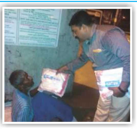
Relief Kit distribution at Avadi Railway Station