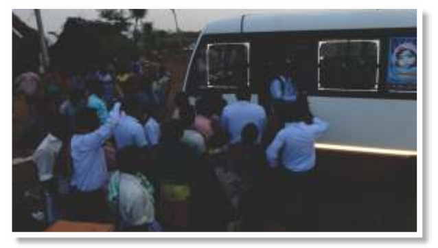
Food distribution at affected area

Other than the team working at Ground Zero, valuable customers also participated in Flood Relief Work