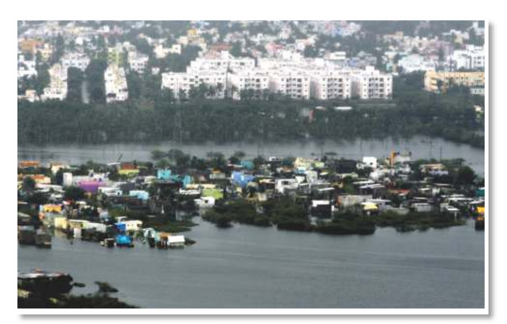
View of affected areas of Kanchipuram District during flood

The 4 week of flooding caused disaster and chaos across the state. More than 400 people lost their lives due to the torrential downpour, over 18 lakhs people were displaced with estimates of damages and loss ranging to Rs.100000 Crs. Power supply was interrupted for over half of the city's neighbourhoods. Train services were cancelled after tracks were flooded and Chennai Airport was also closed with some parts of the Airport reported to be under 7 feet (around 2 metres) of flood water. The Tamil Nadu districts of Cuddalore, Kanchipuram and Tiruvallur were badly affected. This situation was also assessed by our CSR Team of Tamil Nadu. They started providing Food Packets, which was identified as immediate requirement as people had lost their homes. Approximately, 300 people on