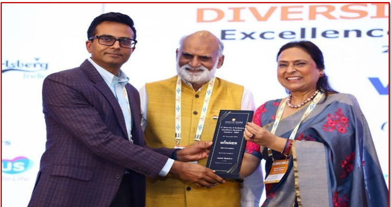
Name of Award: ASSOCHAM – 4th Diversity and Inclusion Award Awarding Agency : Best Employer for PwDs Year : 2023