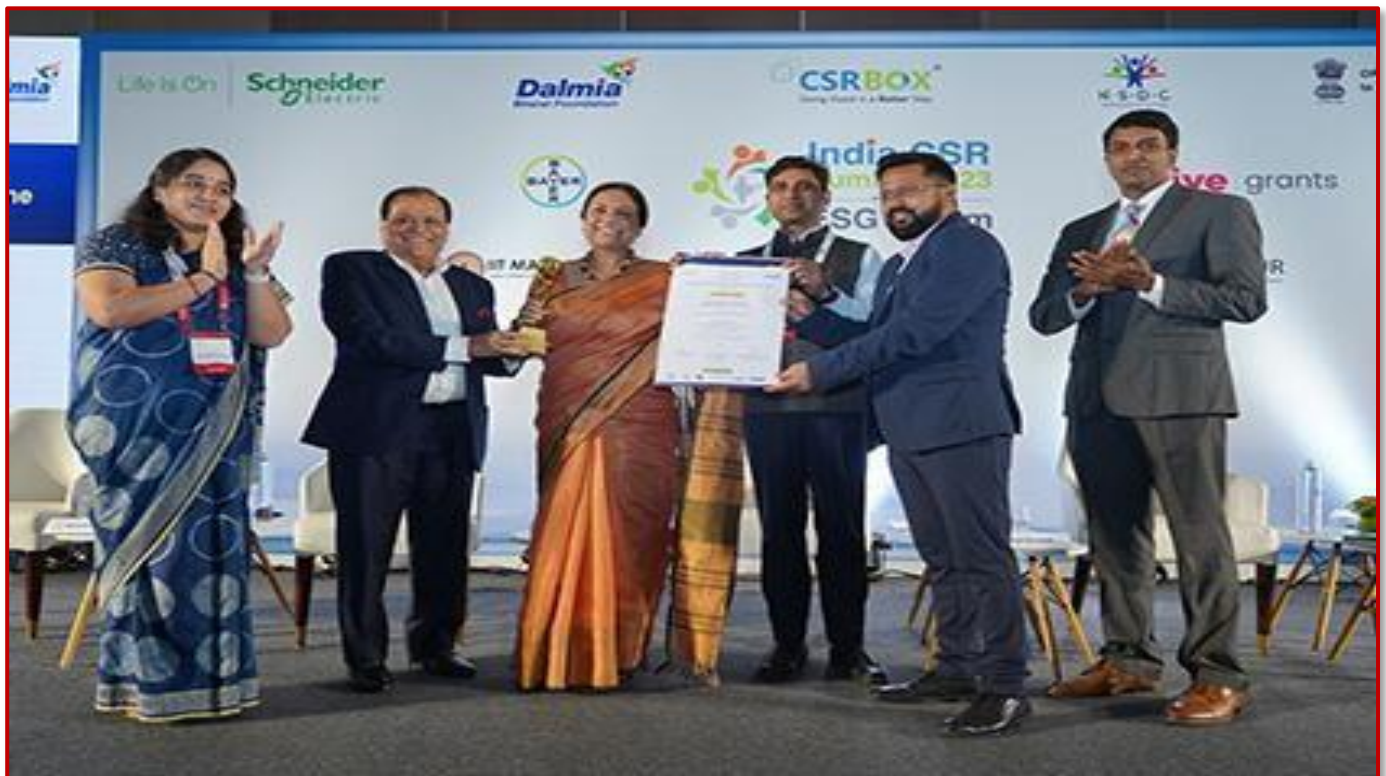
Name of Award: CSR BOX CSR Impact Award Awarding Agency: Dalmia Bharat Date : Oct 11, 2023