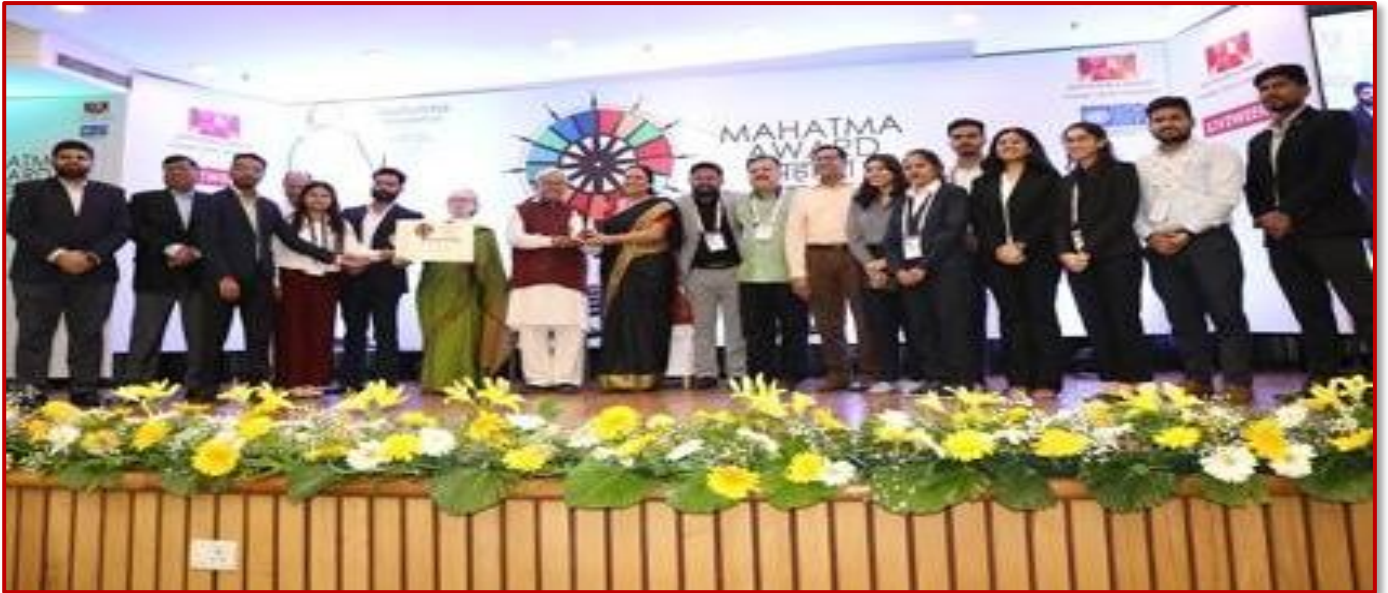
Name of Award: Mahatma Award 2023 Awarding Agency: Mahatma Foundation Date : 2023