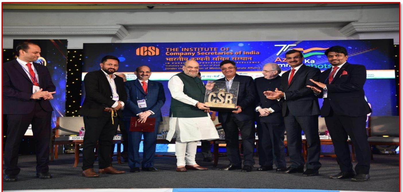
Name of Award: ICSI Prestigious 6th Annual National CSR Award Awarding Agency : ICSI Date : Dec 16, 2021