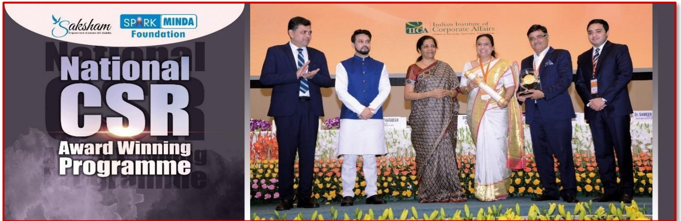
Name of Award: National CSR Award Awarding Agency : Ministry of Corporate Affairs Year : 2019