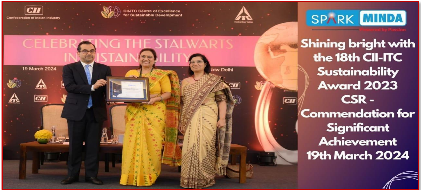
Name of Award: CII - ITC Sustainability Award 2024 Awarding Agency : Commendation of Significant Achievement in CSR Year : 2023