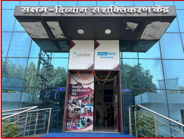
Noida, Uttar Pradesh