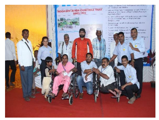
Members of the Spark Minda team with the beneficiaries

4. Partnership and collaboration: It is also important to identify and collaborate with the right organizational partners that help widen the reach of the envisioned program. Partners also facilitate the increase in the depth of work being done. Each identified partner must be working for the cause of persons with disabilities be it in employment, skilling, UDID registration or in providing assistive aid.