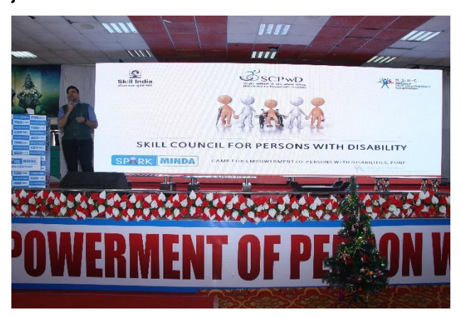
A workshop by Sector Skill Council for Persons with Disability during the camp

A Seven-day camp from 20<sup>th</sup> to 26<sup>th</sup> December, 2019, was organized at Chimbali Phata, Pune. The idea behind this camp was to put up a one stop facility for the persons with disability where they can avail benefits of free of cost assistive aids, job fair, and Unique Disability ID registration. The programme was organized in collaboration with Confederation of Indian Industries (CII), Skill Council for Persons with Disability (SCPwD), Vishwa Yuva Kendra, Jaipur Foot and India Business Disability Network (IBDN). Aegis Global, Godrej-Agrovet, Sodexo, Sarovar Hotels, Accor Group, Accenture and Cummins participated in the job fair.