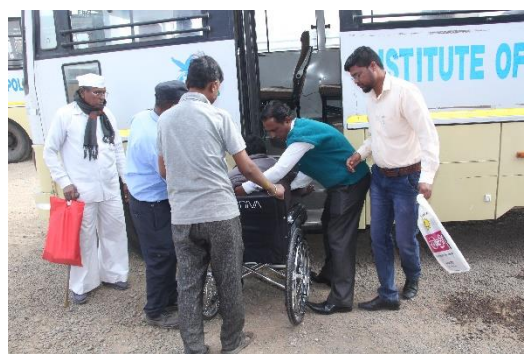
Buses were arranged for ensuring comfortable movement of beneficiaries to the camp site