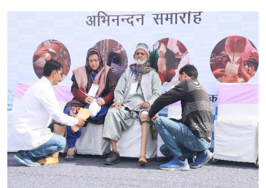
Limb fitment camp organized in Uttar Pradesh in 2017

In Spark Minda Group community development is a value driven concept since its inception. The Six intervention areas in which the Foundation operates, Empowerment of Persons with disability is one of the major areas of intervention. This program supplements the Accessible India Campaign of Government of India. Saksham programme is also in-line with the Sustainable Development Goal 10 Reduced Inequalities, which aims at provision of employment to the PWDs, in creating an inclusive environment, in providing accessibility to the PWDs, in aiding the procurement of disability certificate, UDID and by partnering with NGOs, likeminded CSR groups and also with the government.