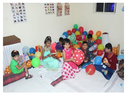
Maternity care center and play room for children