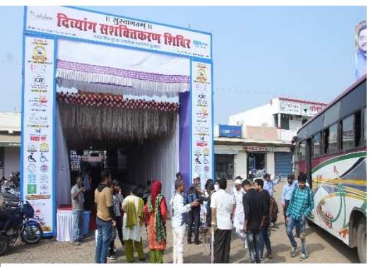
Empowerment of Persons with Disability Camp, December 2019

In the coming years we aim to incorporate the UDID registrations as a regular facility at the Saksham center. Organizing job fairs will be streamlined and a set schedule will be drawn out before the commencement of the camp. It is expected that, in May , 2020, a camp will be organized in Uri, Kashmir , in collaboration with the Indian Army.